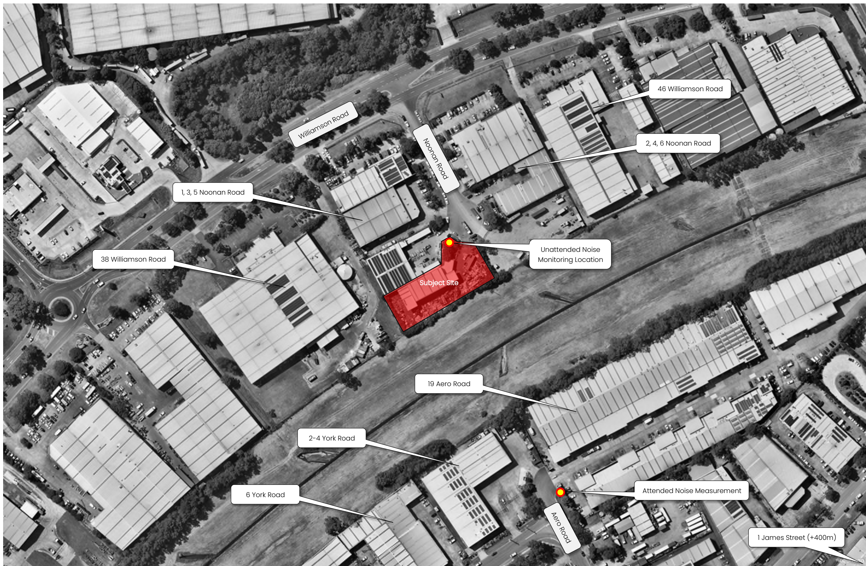
Figure 1: Site Context